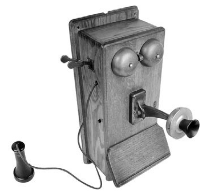
This is an old telephone