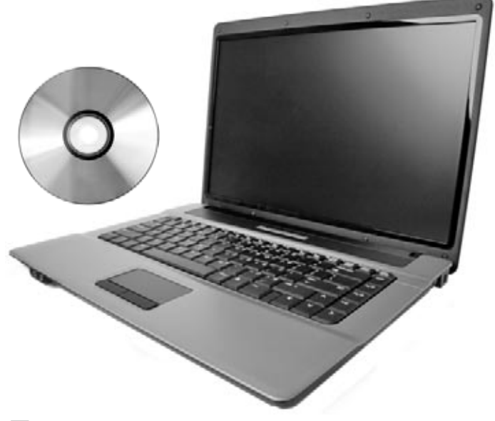
This is a new computer.