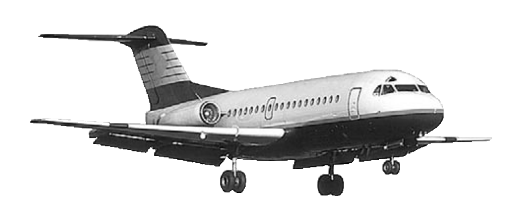
This is a new plane.