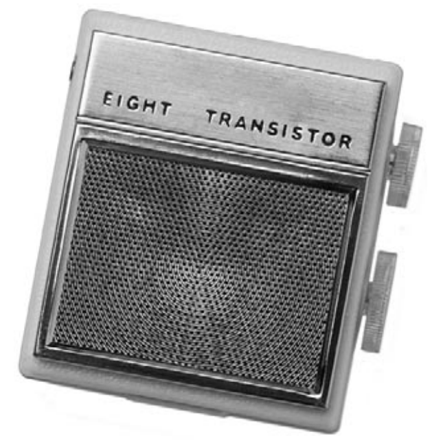
This is an old music player.