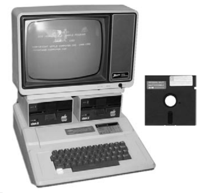
This is an old computer.