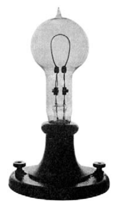
This is an old light bulb.