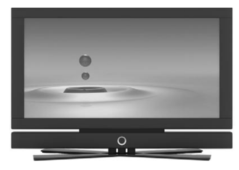
This is a new television.