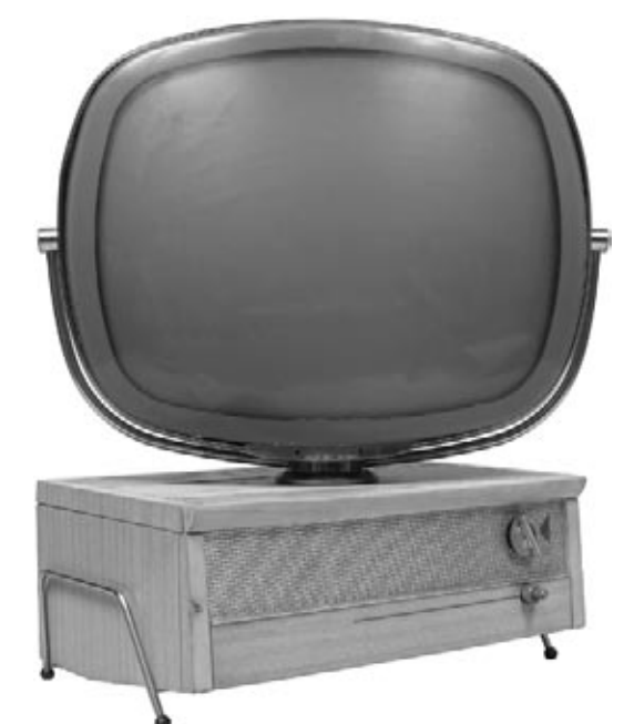
This is an old television.