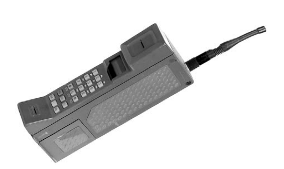
This is an old cell phone.