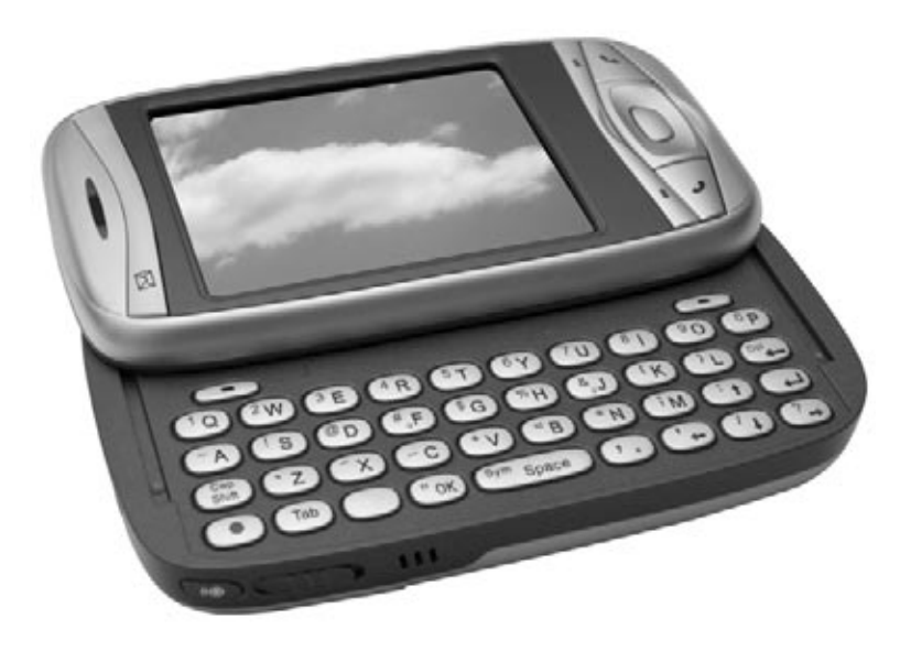
This is a new cell phone.