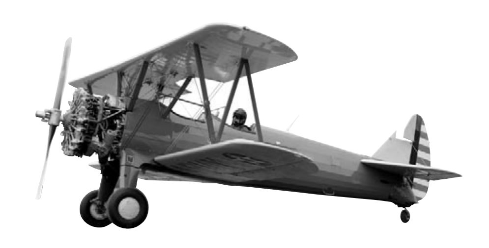
This is an old plane.