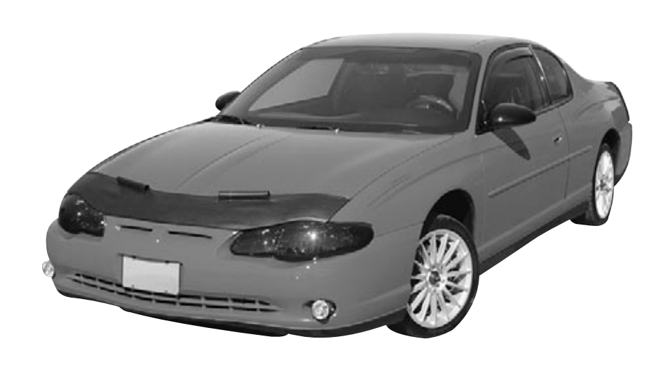
This is a new car.