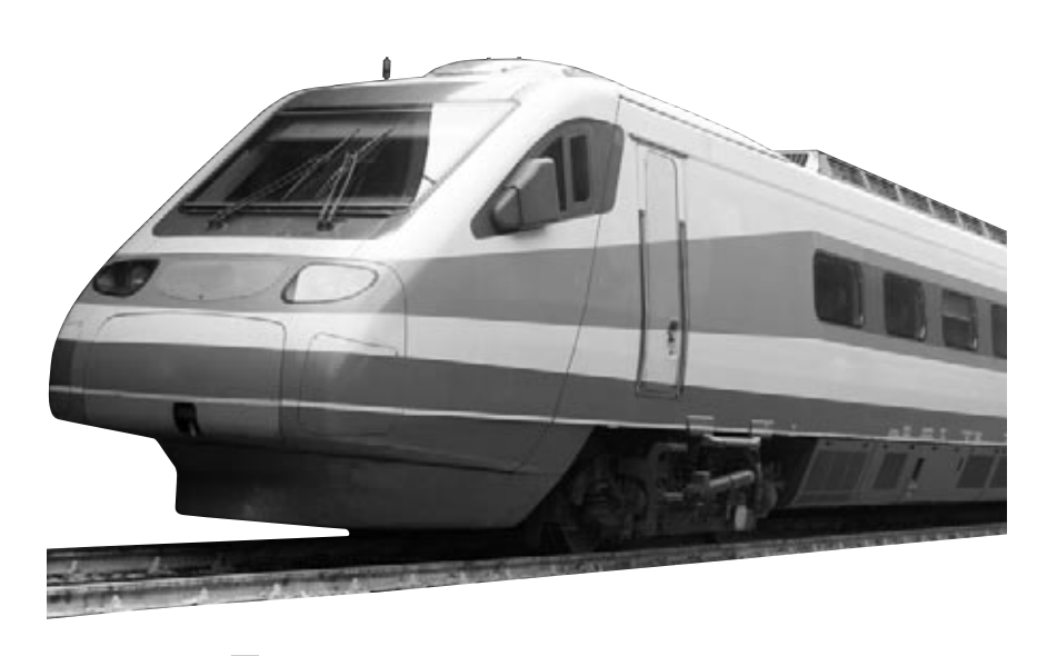
This is a new train.