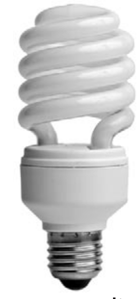
This is a new light bulb.