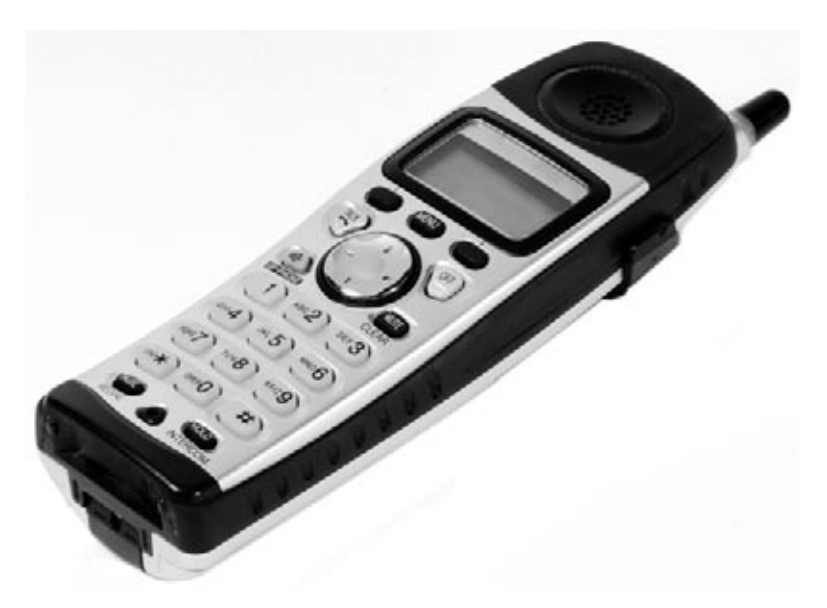
This is a new telephone