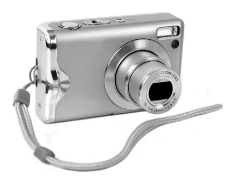
This is a new camera.