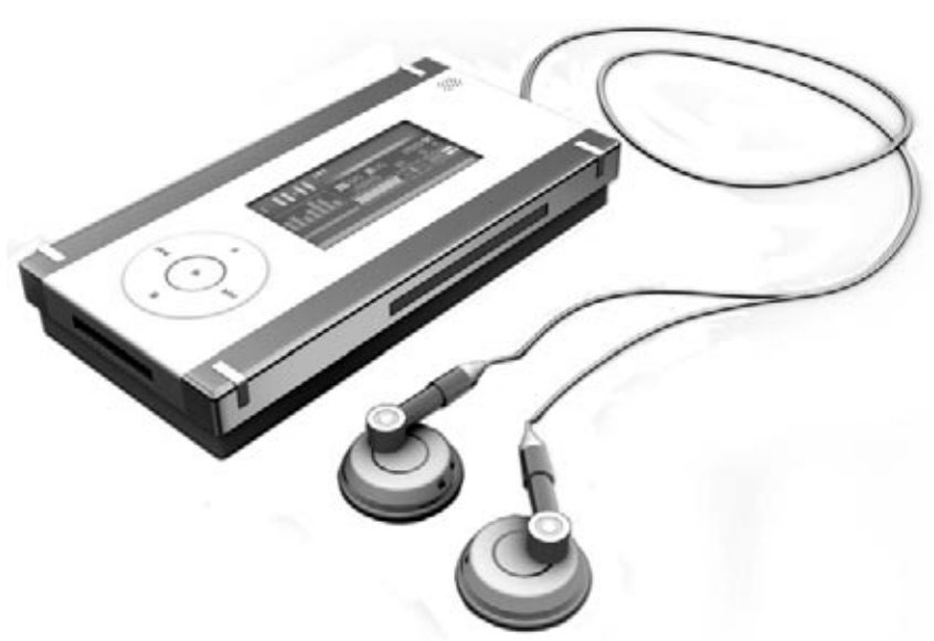
This is a new music player.