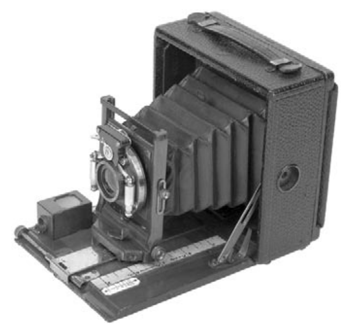
This is an old camera.