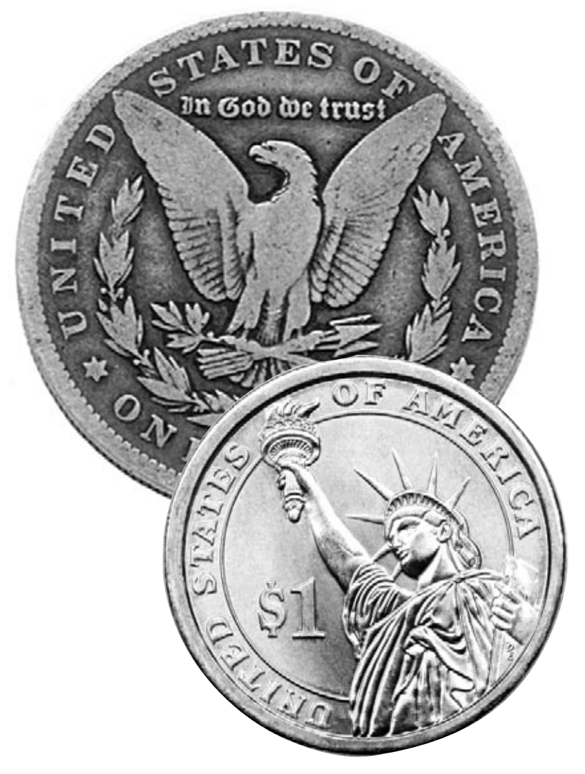
Written by Craig Frederick www.readinga-z.com