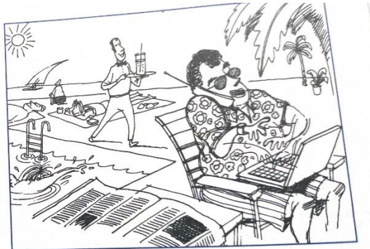
He works all the time—he never relaxes.