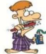
Brush the teeth