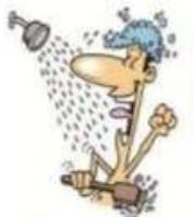
Take a shower