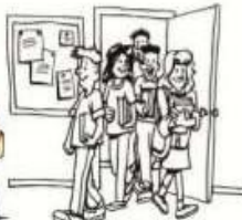
Leave the school