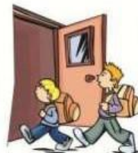
Arrive to school