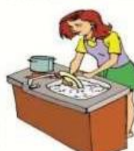
Wash the dishes