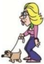
Walk the dog