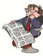
Read the newspaper