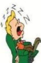
Make a nap