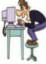
Surf the net