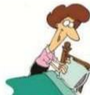
Make the bed