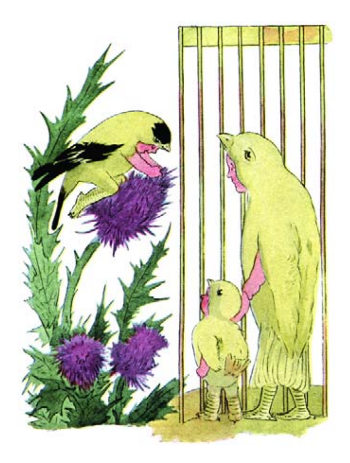
Canary-bird said to his mother: "Is that bird in the tree my brother?" Mama Canary said: "Oh, no! He's just a cousin — wild, you know."

Said Nightingale: "It's not my way To practice singing in the day, But wait till all the rest are through And I will gladly sing for you."