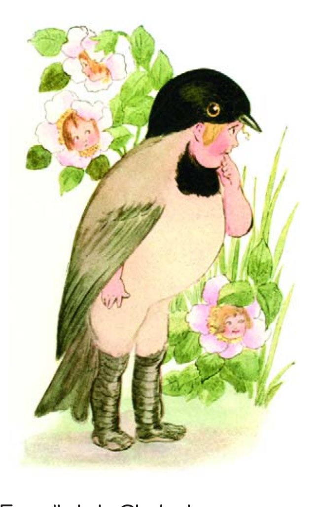
Friendly little Chickadee Is just as cunning as can be; Upon your windowsill he'll come And thank you kindly for a crumb.

Said Father Goose: "I think I'll take A stroll this morning to the lake." Mother Goose said: "Then I'll go, too, And maybe take a swim with you."